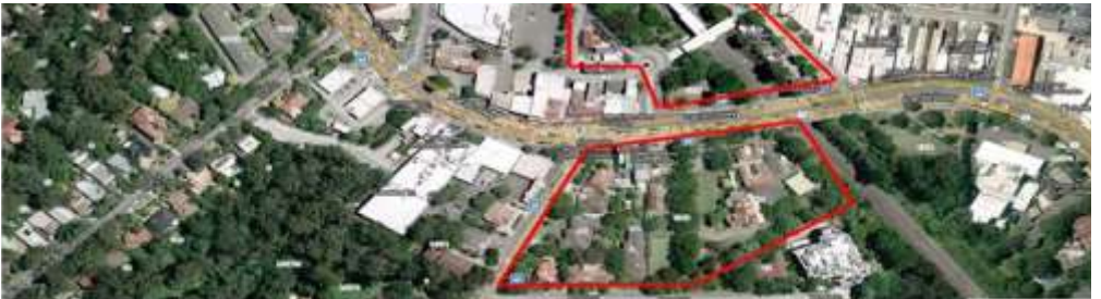
Aerial photograph of Turrumurra Railway Station, Turrumurra Village Park, Turrumurra Lookout Park, 'Hillyview' and Hillyview Heritage Conservation Area — bounded by Pacific Hwy, Bassingpoint Road and Boyd Street, Turrumurra.