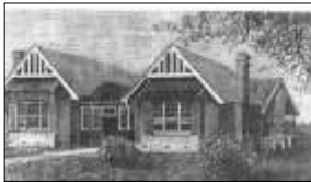
Residence of Ivan AuPrince