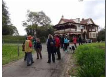
2015 FOKE Turrumurra Heritage Walk